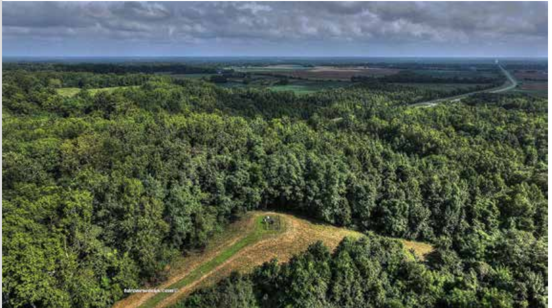
Aerial grave site of Edmund Ruffin at his Marlbourne Plantation in Virginia. In picture old school FireEaters Camp members (Mr. Tingle) following the charge.